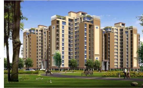
Feasibility Study Report Mixed Use Apartment Prepared by Spear Alliance Feasibility Study for Mixed Use Apartment LLC/USA