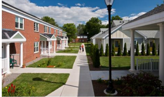
Feasibility Study Report 13 Housing Units Prepared for: Central Feasibility Study for 13 Housing Units USA