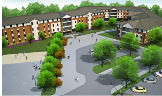
Feasibility Study Report College Housing Unit Prepared by: SPEAR ALLIANCE Feasibility Study for College Housing Unit in Talladega