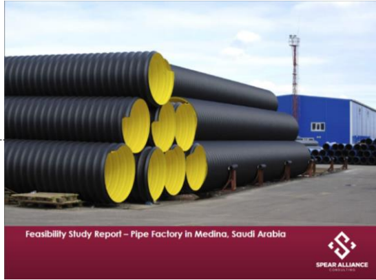
Feasibility Study Report – Pipe Factory in Medina, Saudi Arabia